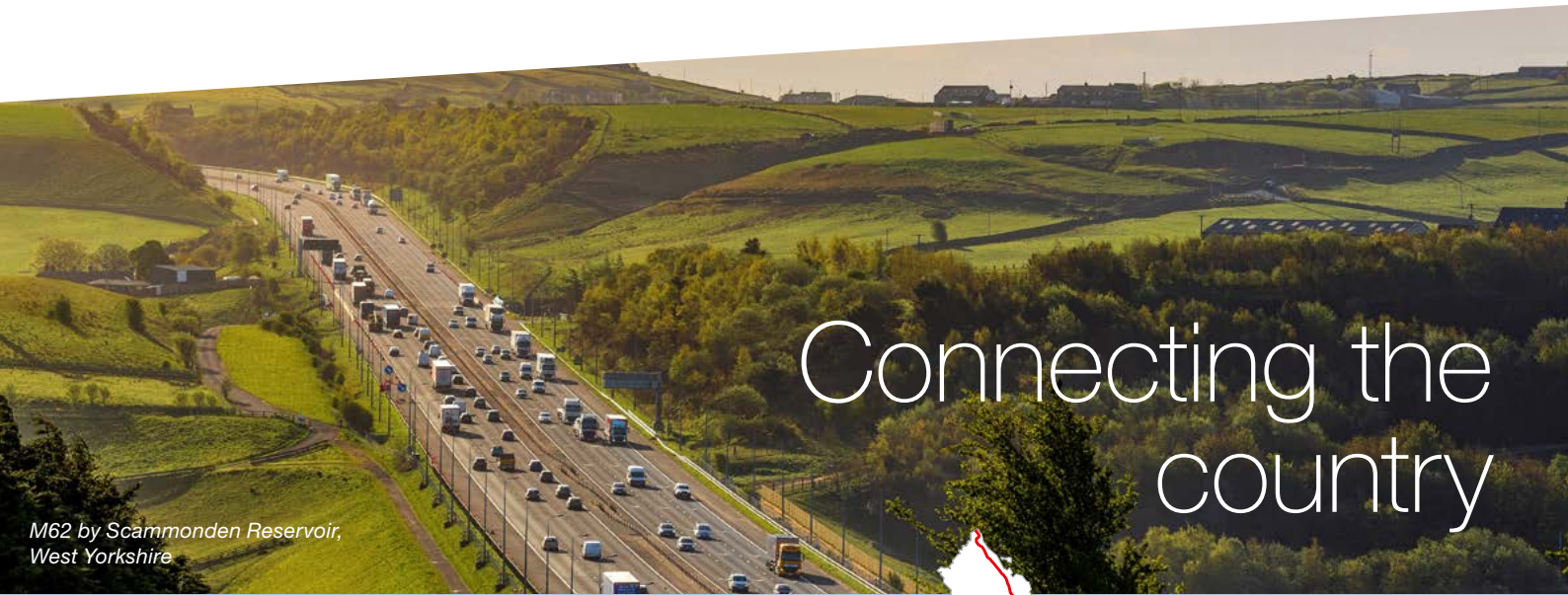
M62 by Scammonden Reservoir, West Yorkshire