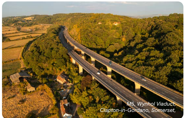
M5, Wynhol Viaduct, Clapton-in-Gordano, Somerset,